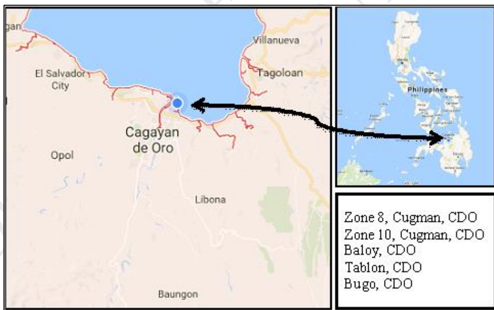
Figure 1. Map of the studied tap water stations in District II, Cagayan de Oro

The water samples were collected from five stations under District II of Cagayan de Oro. These stations included Zone 8 Cugman, Zone 10, Cugman, Baloy, Tablon, and Bugo. Each station was composed with four other substations (approximately 5 m-10 m apart) as sources of tap water analyzed in the laboratory (refer to Figure 1).