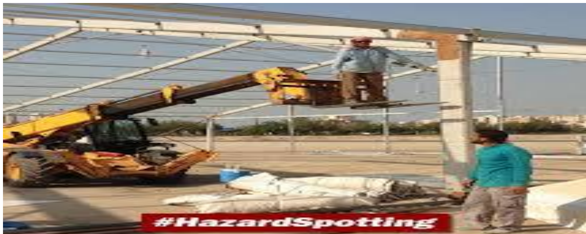
Figure 1.4: Harzard spotting during an electrical work

The route that the current takes through the body affects the degree of injury. If the current passes through the chest cavity (e.g., left hand to right hand), the person is more likely to receive severe injury or electrocution; however, there have been cases where an arm or leg was burned severely when the extremity came in contact with the voltage and the current flowed through a portion of the body without going through the chest area of the body. In these cases the person received a severe injury but was not electrocuted.