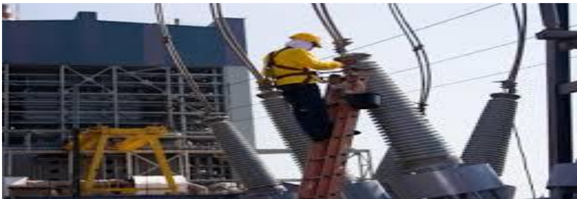
Figure 1.0: A photograph showing an electrical worker rectifying fault on a high tension wire

Our world is filled with overhead power lines, extension cords, electronic equipment, outlets and switches. Our access to electricity has become so common that we tend to take our safety for granted. We forget that one frayed power cord or a puddle of water on the floor can take us right into the electrical danger zone and that it doesn't take a lot of electricity to kill. In fact, the amount of current needed to light an ordinary 60-watt light bulb is 5times what can kill a person. Thus, all electrical equipment in construction sites is potentially deadly. An electrical hazard is therefore a dangerous condition where a worker makes electrical contact with energized equipment or a conductor. Electrical Safety in the workplace is the most important job of an electrical worker. No matter how much training one has received or how much employers try to safeguard their workers, Electrical Safety is ultimately the responsibility of the electrical worker. The human factors associated with electrical accidents can be immeasurable. No one can replace a worker or loved one that has died or suffered the irreparable consequences of an electrical accident. Most accidents can be prevented by taking simple measures or adopting proper working procedures. If we work carefully and take appropriate safety measures, there will definitely be fewer work injury cases, and our sites will become a safe and secure place to work in.