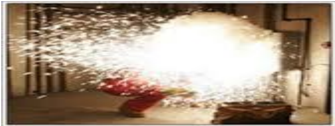
Figure 1.2: A photograph showing an explosion when rectifying a fault.

Burns are not the only risk. A high-amperage arc produces an explosive pressure wave blast that can cause severe fall related injuries.