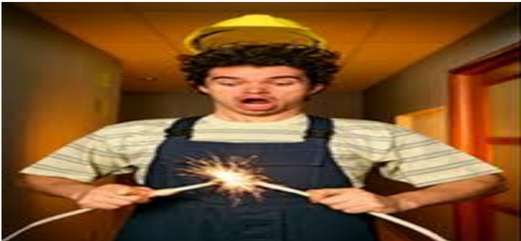
Figure 1.1: A photograph showing an electrocution due to contact with live wires

voltages, current will pass between them if they are connected. The body can connect the wires if it touches both of them at the same time thereby allowing current to pass through. You can even receive a shock when you are not in contact with an electrical ground. Contact with both live wires of a 240-volt cable will deliver a shock. (This type of shock can occur because one live wire may be at +120 volts while the other is at -120 volts during an alternating current cycle—a difference of 240 volts.) [9] You can also receive a shock from electrical components that are not grounded properly. Even contact with another person who is receiving an electrical shock may cause you to be shocked.